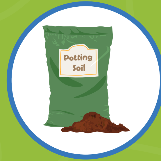
Potting soil (or soft, well-draining soil)