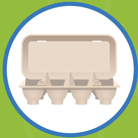
1 egg carton