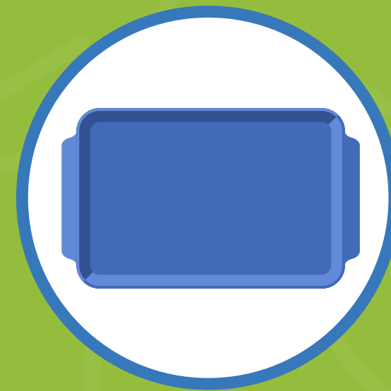
A tray or plastic box lid